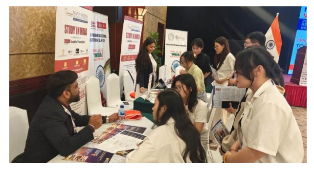
Interactive Session with Students