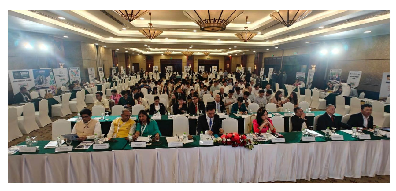
Namaste Vietnam || Bharat - Vietnam Higher Education Summit 2024